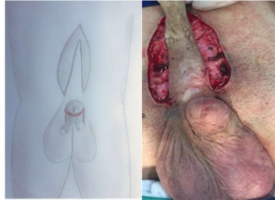
Fig. 1. Construction of a lower base triangle flap the abdominal wall.

Currently he is well, having gained more than 4 cm in penile body length (Fig. 3).