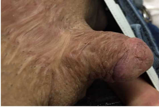
Fig. 3. Penile aspect almost 1 year after the confection of an abdominal wall flap. Despite the skin scarring, the skin coverage allowed for accommodation of the corporal bodies.