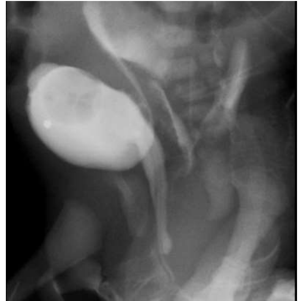
Fig. 3. Voiding cystourethrogram at 3 months.

cannulated. We will await further maturation of the patient and discussions with family for shared decision-making prior to pursuing definitive reconstruction.