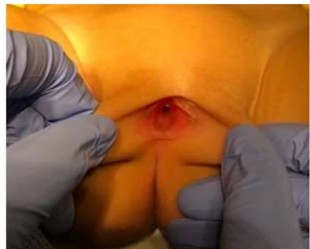
Fig. 2. Genitourinary examination at 2 years of age.

Abdominal ultrasound on day 1 of life revealed a markedly distended vagina (8 x 6.3 x 7 cm), decompressed bladder, and bilateral